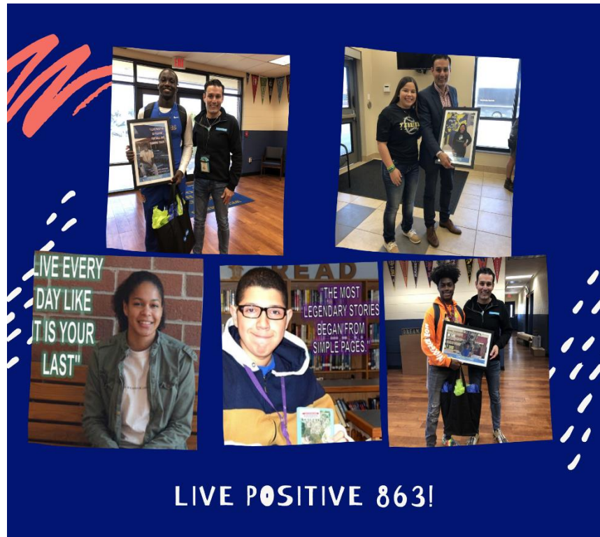
Here are the winners from our latest LivePositive863! campaign.

This program allows for youth who are nominated by their principals to mentor their peers and transform the perception to make others realize that most youth are not using drugs and/or alcohol.