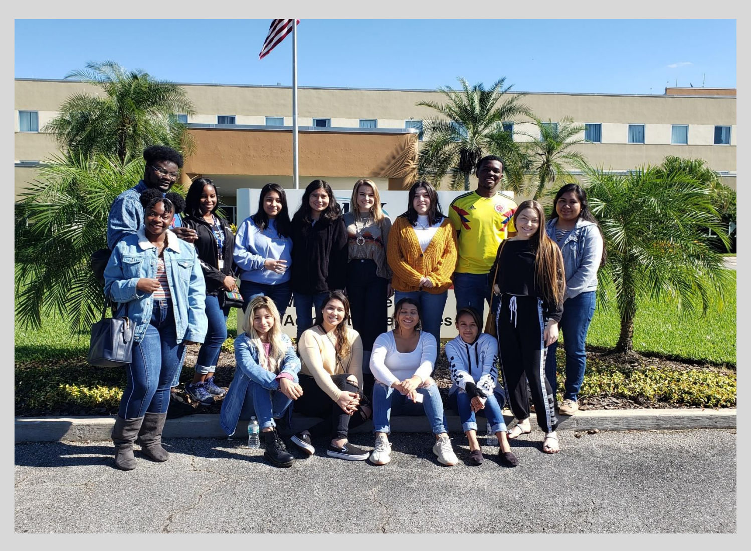
November 21, 2019 - Criminal Justice, Health, and Community Resource Day